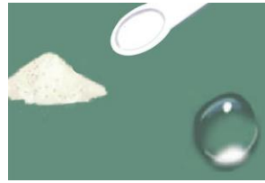
3. Take powder and liquid, mixing ratio 1:1