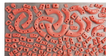
Gingiva 102 per print, 24 min