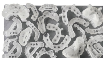
Surgical Guide 16 per print, 45 min