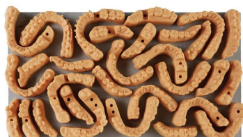
Implant Model 30 per print, 90 min