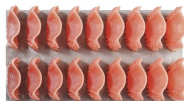
Denture Base 18 per print, 100 min